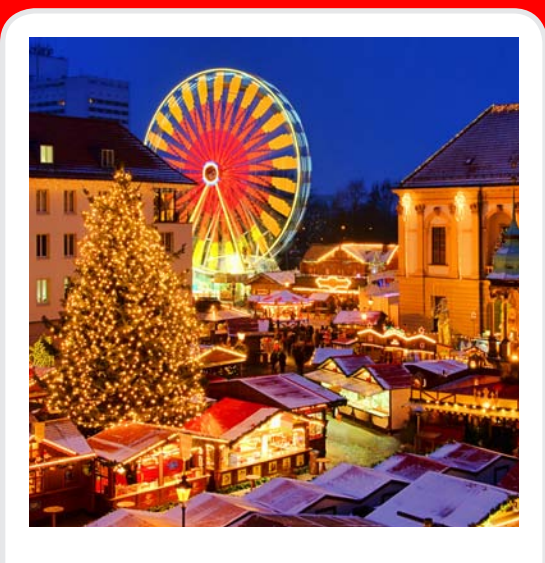
Christmas in Germany from $1,699<sup>*</sup><sub>pp</sub>