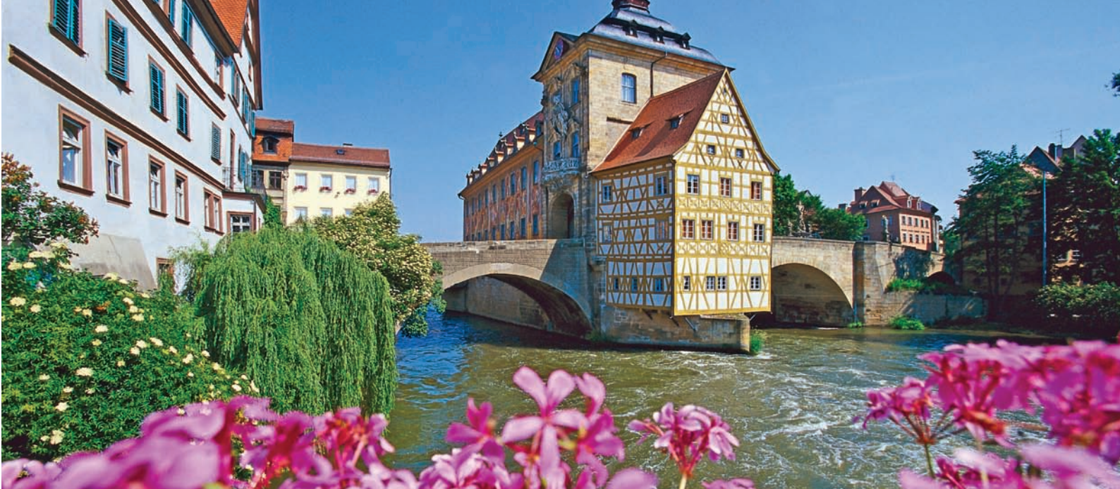
Bamberg, UNESCO World Heritage Site

labyrinths of the Cave Hospital, the underground hospital was once used as a nuclear bunker and contains a number of wax figures and original medical equipment dating back to WWII and the Cold War era.